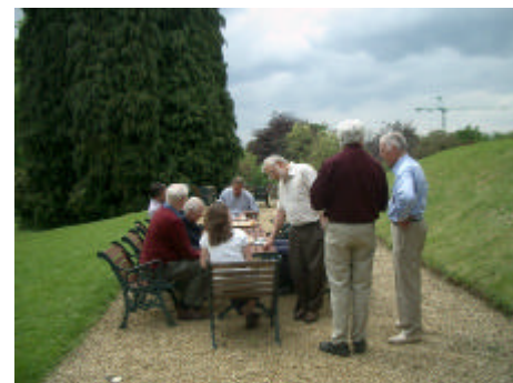
Delegates during lunch in the Headington Hall gardens