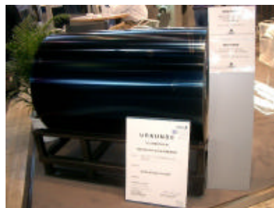
Coil coated selective absorber coating for solar thermal applications