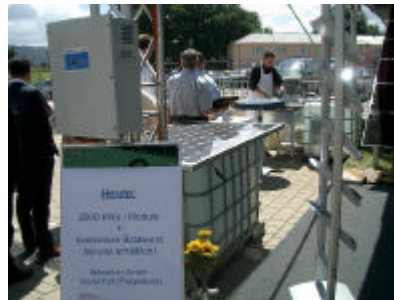
The sun was out in force on the first day of Intersolar. Above shows a stall where sausages were fried for free with a solar cooker.