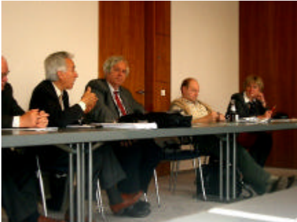
ISES-Europe AGM: representatives from ISES Italy, Romania, Denmark and Poland

The congress included a number of workshops and also the Annual General Meetings of ISES-Europe and ISES. At the ISES-Europe meeting the benefits and disadvantages of the current format of EuroSun were discussed and options