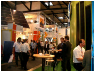
View of the exhibition of hall

Intersolar 2004, Europe's largest trade fair for solar technology, which took place in Freiburg immediately after EuroSun 2004. The exhibition was most impressive, with 286 exhibitions, but regrettably there were very few UK companies.